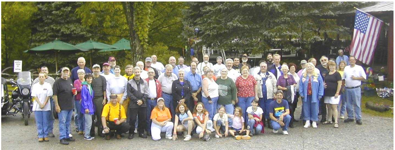
A blast from our past! Howdy Summer at TWO