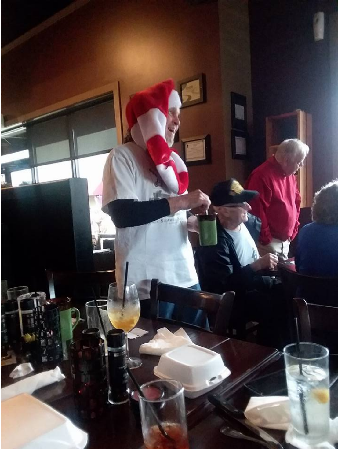
2018 Christmas Party