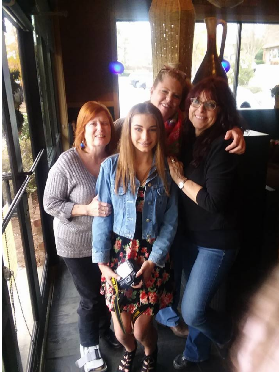
2018 Christmas Party

January 18-21, 2019: Choose Your Hero Weekend at Victoria Bryant State Park near Royston, GA